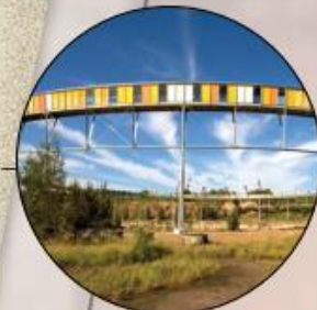
Dual Name Signage