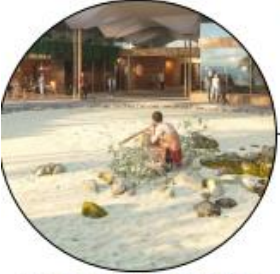
Ceremonial Dancing Sand Circle